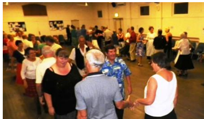
Last year's British Isles Night